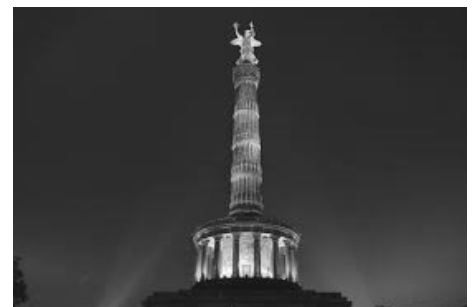
Siegessäule - triumphal column